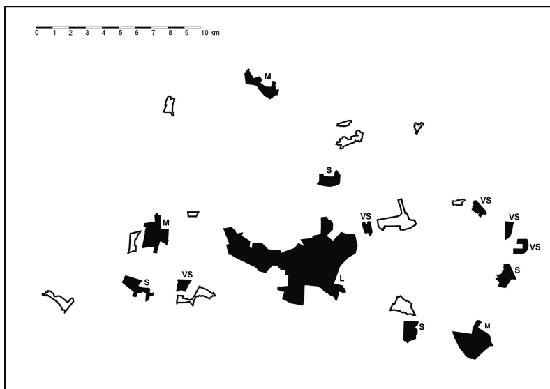
Fig. 1. Distribution of the forest islands in study area (the forest islands under study are marked in black). L – large, M – medium, S – small, VS – very small.

most cases, often over 100 years old, with a rich layer of young trees and undergrowth. Clear cuts are rare, approaching a dozen or so hectares in size in the large island only.